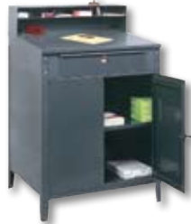
Locking Cabinet Order No. RZ50-640 Mfg. List Price $570.00