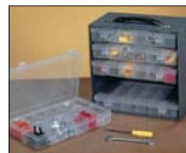
SB55-290 (drawers sold separately)