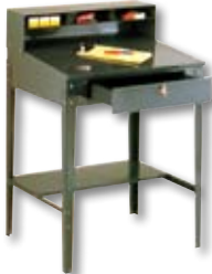
Lower Shelf/Footrest Order No. RZ50-620 Mfg. List Price $339.80